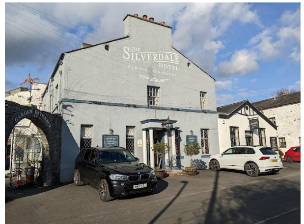
The Silverdale Hotel, Shore Road, Silverdale, Lancashire LA5 0TP

Please let me know if you will be coming and staying for lunch.